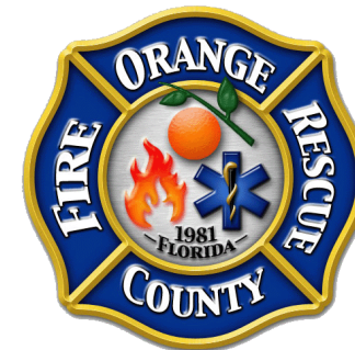
Fire Apparatus Technician