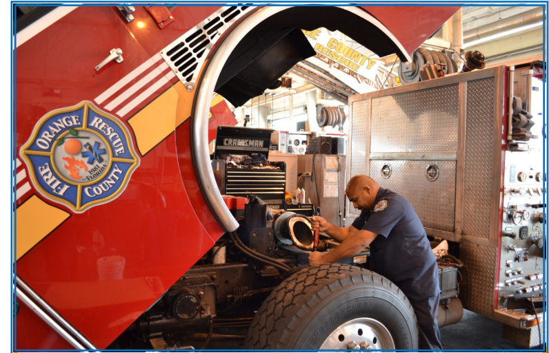
Fire Rescue Department